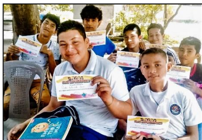
Boys in Nicaragua showing certificates from completing TMC Bible lessons

TMC challenges indigenous churches and national leaders to wake up to the spiritual needs of children and youth. It then partners with indigenous volunteers who want to reach children, yet lack resources. It trains them to evangelize children and provides them with children's