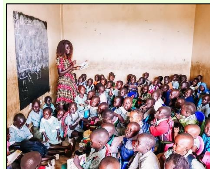
A teacher in South Sudan teaching a TMC lesson to a group of children

✓ BIBLE COURSES —21 age-specific Bible courses. The lessons are delivered by hand, the internet, and postal mail; also through churches and public schools.