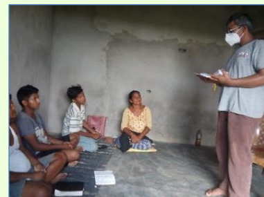
A JESUS Film team leads a discipleship follow-up meeting with new believers in Nepal.

✓ EVANGELISM —Teams show the JESUS film and use other evangelism tools.