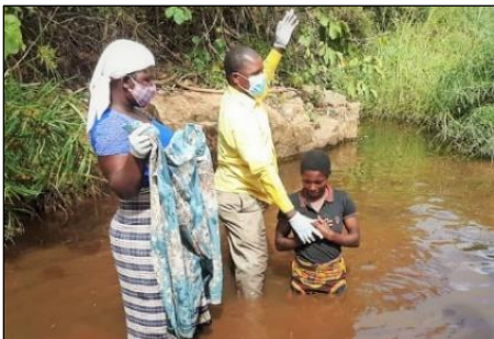
A new believer is baptized in Malawi

JESUS Film Evangelism Teams are comprised of three to five trained, indigenous evangelists. They travel and meet local church leaders, ask where a new church is needed, and ask what "mother" church nearby might be able to provide a lay leader to help with a new "preaching point," or nascent church. Then the teams go to these remote areas and present the gospel, usually using the JESUS film. The film is screened using a variety of devices, such as specialized solar-powered devices or cell phones. People gather to watch the film and hear the audio in their heart language. Teams stay in the area for a month, to meet with the new believers for follow-up and discipleship. Usually, a new preaching point is established, but in some