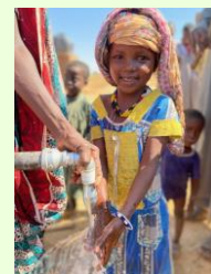
A young girl from Dourkmoura village in Dourbali, Chad washes her hands at a new solar-powered water pump system.

✓ RESOURCES —NT provides equipment and technology, such as pumps, water tanks, and sanitation systems.