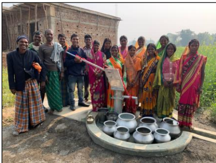
Community members of Kamal village in Jharkhand, India gather around a new hand pump well.

Applicants are required to: demonstrate majority community participation, raise a repair fund amongst community members, provide a bank statement confirming the pooled