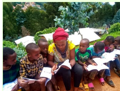
A teacher in Tanzania teaching a TMC lesson at the Gihembe refugee camp

✓ BIBLE COURSES —21 age-specific Bible courses. The lessons are delivered by hand, the internet, and postal mail, also through churches and public schools.