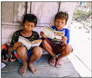
Boys in Indonesia reading TMC Bible lessons

TMC challenges indigenous churches and national leaders to wake up to the spiritual needs of children and youth. It then partners with indigenous volunteers who want to