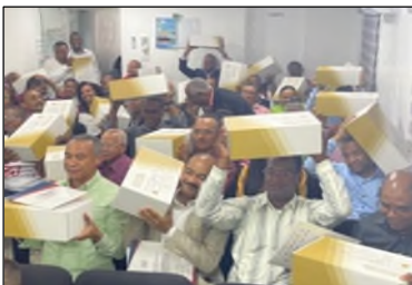
Pastors in the Dominican Republic receiving outreach kits to mobilize local churches for Evangelism.

DP vets each ministry partner on an ongoing basis, both from its headquarters and through annual field visits. Each ministry partner follows the same model: they pay the salaries of indigenous leaders and support them in their work. These indigenous leaders go into villages where