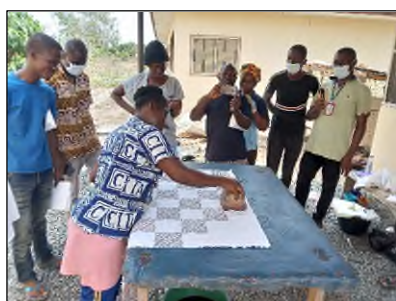
Teaching how to decorate fabric in Ghana.

To equip communities through Christ-centered and holistic development, MAI makes holistic disciples who in turn make holistic disciples. MAI provides instruction in community health practices, together with the gospel,