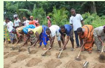
Villagers learning from the CHE trainers how to ‘farm God’s way’ in West Africa

EVANGELISM —Drawing on more than 5,000+ lesson plans, trained workers instruct in holistic development, and train others.