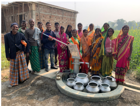
Women and children in Triltoli Village, India, gather around their new hand pump. They used to walk more than 2 miles to reach a dirty water source. Now they have clean water minutes from their homes.

Applicants are required to: demonstrate majority community participation, raise a repair fund amongst community members, provide a bank statement confirming the pooled repair funds have been deposited into a proper account,