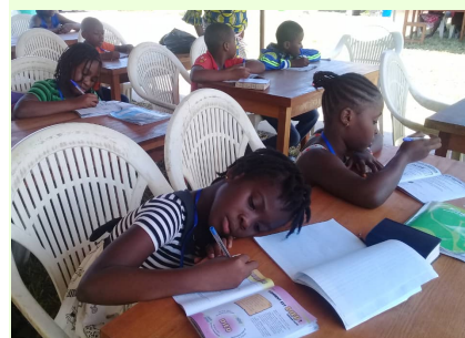
Children studying their Explorers Club Bible lessons in Sub-Saharan Africa.

✓ BIBLE COURSES: 21 age-specific Bible courses. The lessons are delivered by hand, the internet, and postal mail, also through churches and public schools.