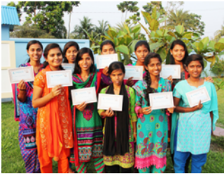
Kids in Bangladesh with their certificates of completion.

TMC challenges indigenous churches and national leaders to wake up to the spiritual needs of children and youth. It then partners with indigenous volunteers who want to