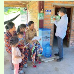
An NT partner trains a family in Cambodia to use and maintain its new household biosand filter.

✓ RESOURCES: NT provides equipment and technology, such as pumps, water tanks, and sanitation systems.