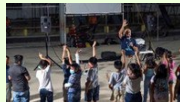
A showing of the JESUS film

✓ NEW TRANSLATIONS —JFP translates and dubs gospel-centered media and resources into languages that need it most.