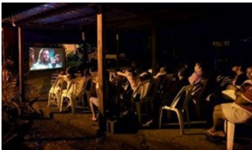
A showing of JESUS using a projector. While more and more people discover the film online, group showings are still a valuable distribution strategy in many contexts.

Cru's founder, Dr. Bill Bright, had the vision to take the story and message of Christ to the world using film. In