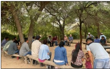
A CHE master trainer facilitates a community meeting in Argentina.

To equip communities through Christ-centered health and holistic development, MAI makes holistic disciples who in turn make holistic disciples. MAI provides instruction in community health practices, together with the gospel, mainly through volunteers' home visits. Staff provide these