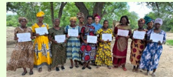
New CHE facilitators proudly display their certificates after completing training.

✓ COMMUNITY HEALTH EVANGELISM (CHE) —Drawing on more than 5,000 lesson plans, instructors teach Christ-centered health and holistic development principles, and they train others to become CHE instructors.