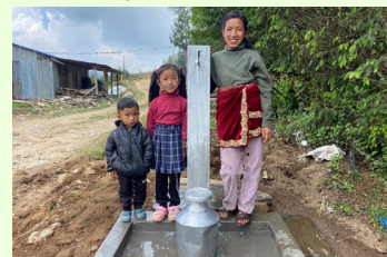
Families in Chisapaani/Patle Village, Nepal who used to walk 45 minutes to get dirty water now get clean water from tap stands at each of their homes.