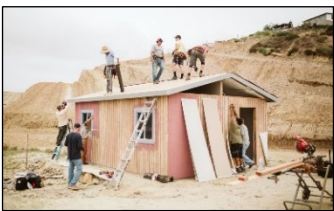
A team builds a Home of Hope in Tijuana, Mexico.

YWAM SDB also "franchises" HoH, equipping other YWAM entities around the globe to provide homes for the needy in their own vicinities.