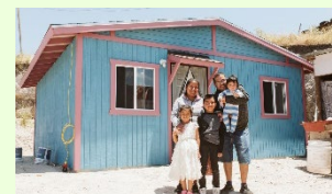
A family receives its new home.

Baja area, and it helps other YWAM entities do this overseas.